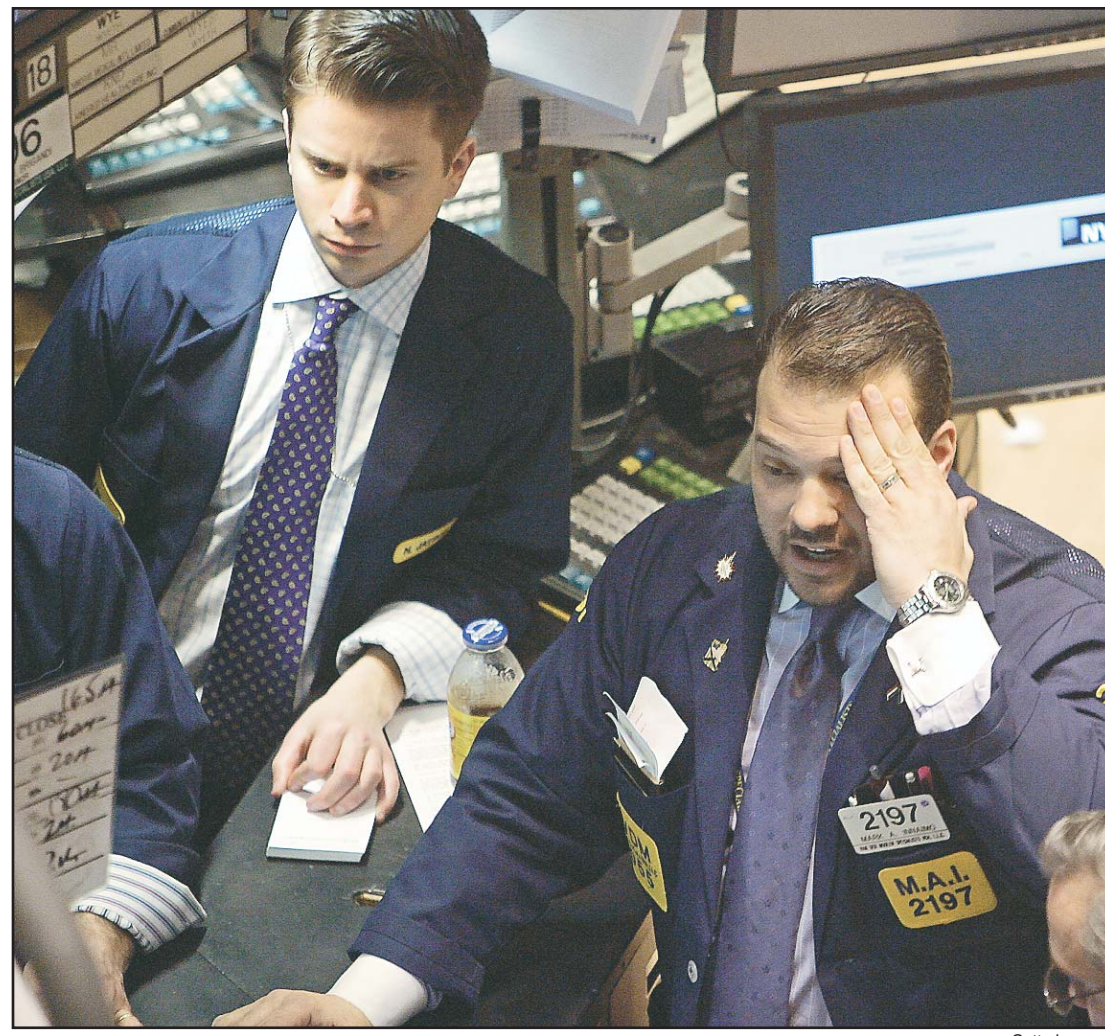
FRENZIED: Traders worked on the floor of the New York Stock Exchange yesterday as the Dow Jones Industrial Average suffered its biggest decline since the September 11 attacks.