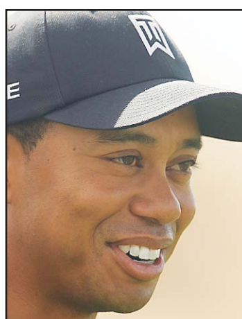
BIG NAME: Tiger Woods' charity has partnered with the PGA Tour to create a new golf tournament in the D.C. area.